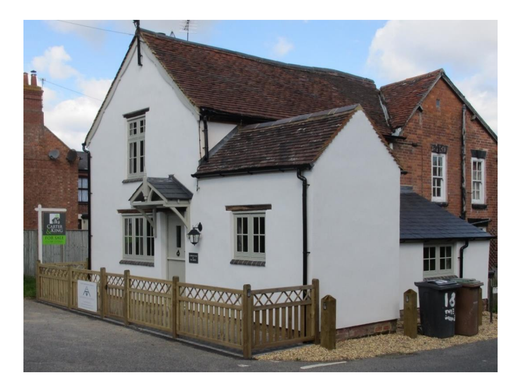
A similar view to that shown above in 1999, in 2017 BLHG PD Barby 2017/017