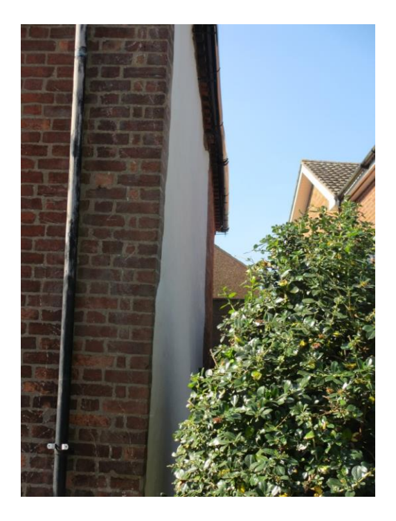
The rendered north wall of Nutshell Cottage

The Nutshell is No 434 on the 1840 Oakley Survey map; it then had a small outbuilding attached to it which was in the yard of The Black Horse . The section of the northern wall of the cottage nearest the road is of cob, seen internally at its recent renovation, covered by rendering on the outside. It must have been part of the original outbuilding and incorporated into the property.