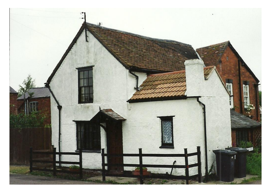
Cobblestones in 1999, Nutshell Cottage beyond to right, BLHG P04/026